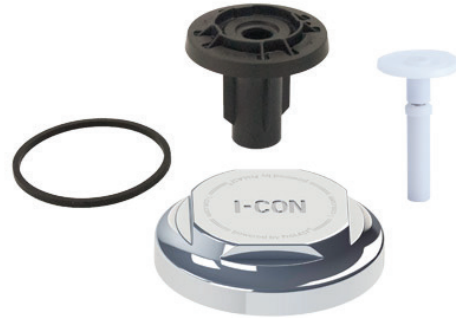
Exposed - 101451 : Zurn Concealed - 101776 : Zurn

COBALT® Retrofit Kit for Exposed & Concealed Manual Flush Valves; Urinals & Water Closets